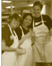
Three students after preparing meals at Our Daily Bread.

Our Cincinnati Urban Experience program aims at engaging college students from around the country in service-learning. Instead of sand and surf on the beaches of Florida or Mexico, we invite students to Cincinnati, Ohio, where they spend their mornings engaging in meaningful service work and their afternoons and evenings learning more about homelessness, poverty and other urban issues. This year we hosted five colleges, totaling 46 students, from around the country. 94% of participants expressed interest in volunteering in their home community.