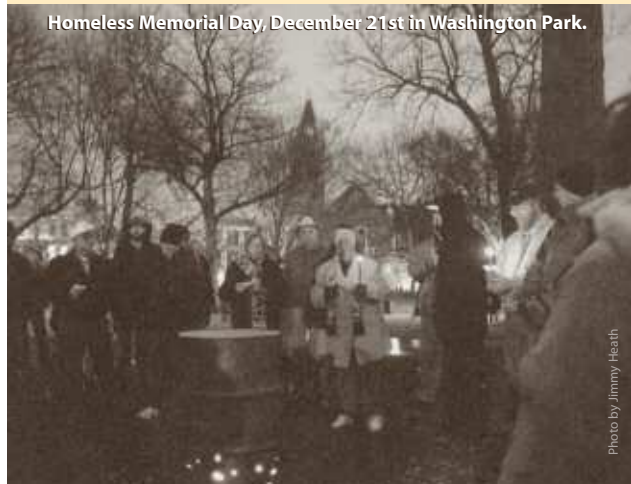
Homeless Memorial Day, December 21st in Washington Park.